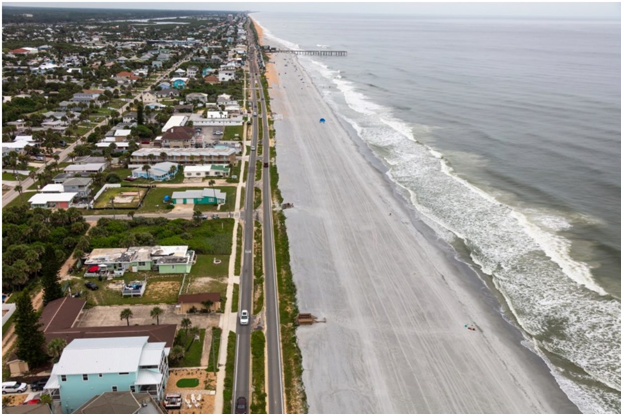
City of Flagler Beach September 2024

And finally on May 2, 2024, after redesign of the project template (due to numerous storms and continued erosion), receipt of all required permits, construction contract advertisement, bid opening, etc. the initial construction contract was awarded to Weeks Marine, Inc. for $27,095,900 (split 65% Federal and 35% non-Federal).