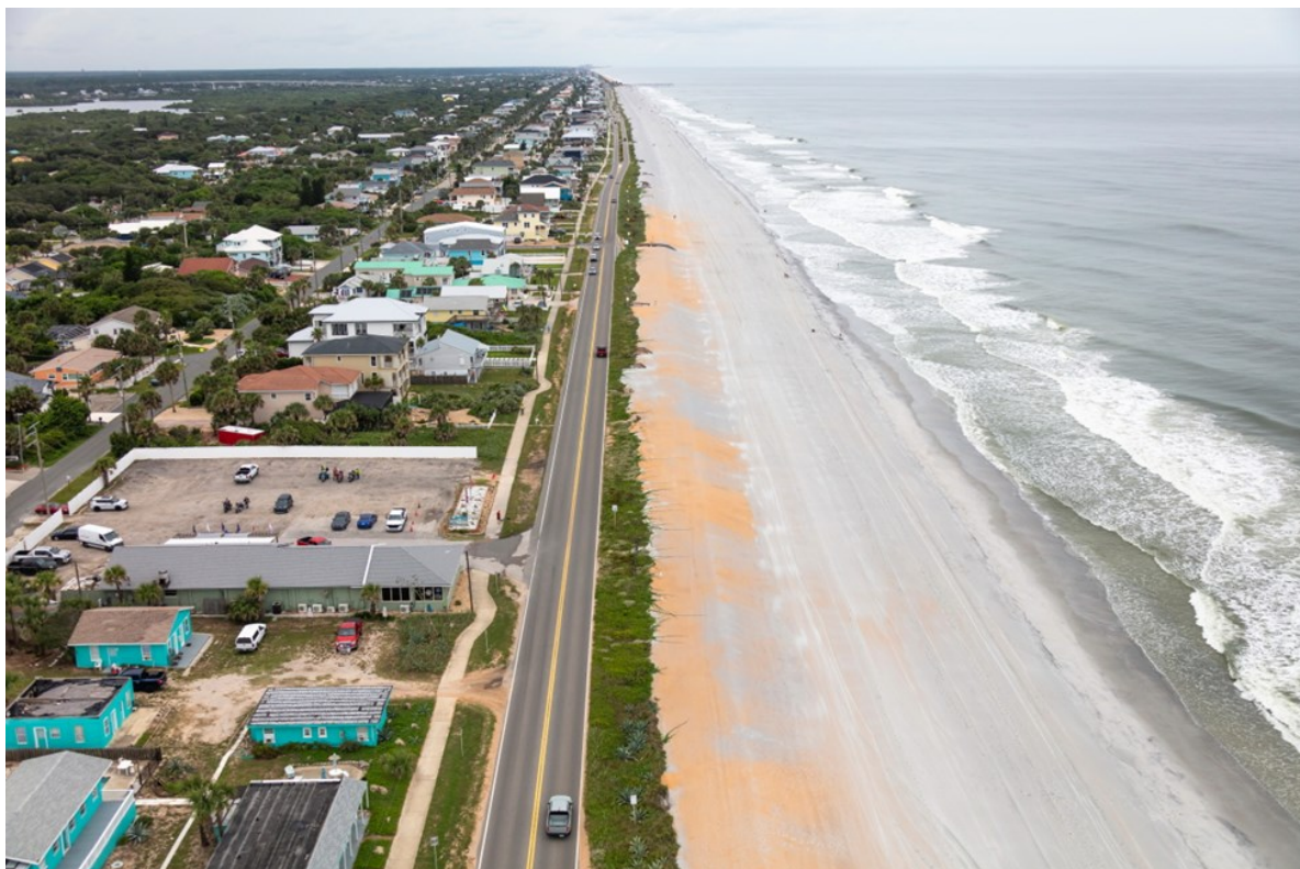
City of Flagler Beach September 2024

In summary, I'll leave with a quote from the great Dwight D. Eisenhower "What counts is not necessarily the size of the dog in the fight, it's the size of the fight in the dog". We fought many years...and prevailed. Enjoy the new beach Flagler County!