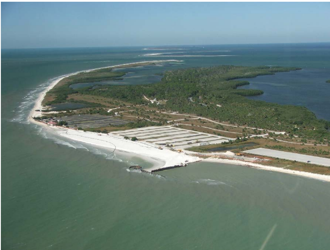
View above Hurricane Pass of construction underway in November 2007 (Photo courtesy of Pinellas County).

Pinellas County awarded a construction contract to Coastal Marine Construction on June 19, 2007, and construction commenced in September 2007. The first action taken was to remove the tremendous amount of large rock, debris and concrete that had been piled on the beach in years past to abate erosion. Pilings that were left on the beach after structures were moved landward, as well as palm trees that died as a result of the erosion, were also removed.