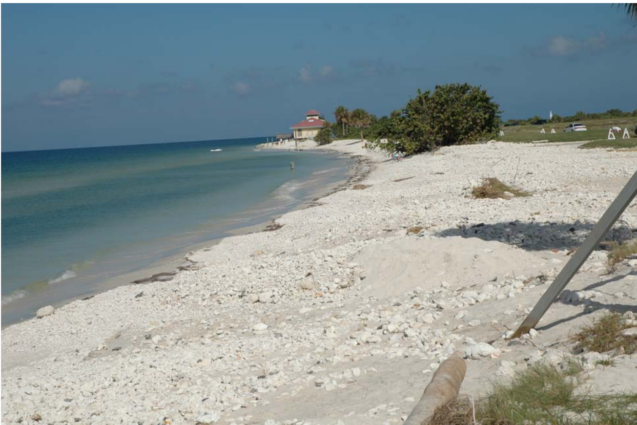
Preconstruction photograph, taken in June 2005, in the main use area at Honeymoon Island State Park.

Recognizing the economic and environmental significance of Honeymoon Island State Park, former FSBPA Chairman, the late James B. Terry, Sr., spearheaded efforts to restore the critically eroded shoreline in the park. Pinellas County initiated the project in 1997.