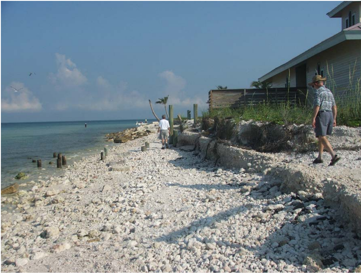
Photograph taken in June 2005, of the severe erosion in front of one of the bathhouses in the main use area of the park (Photo courtesy of Pinellas County).

Pinellas County awarded a construction contract to Coastal Marine Construction on June 19, 2007, and construction commenced in September 2007. The first action taken was to remove the tremendous amount of large rock, debris and concrete that had been piled on the beach in years past to abate erosion. Pilings that were left on the beach after structures were moved landward, as well as palm trees that died as a result of the erosion, were also removed.