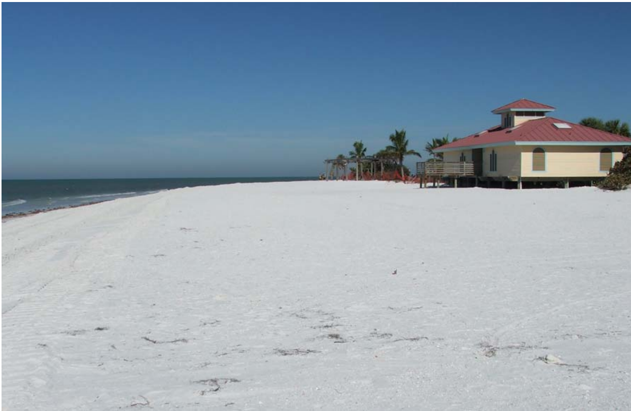
Photograph of the bathhouse immediately after construction.