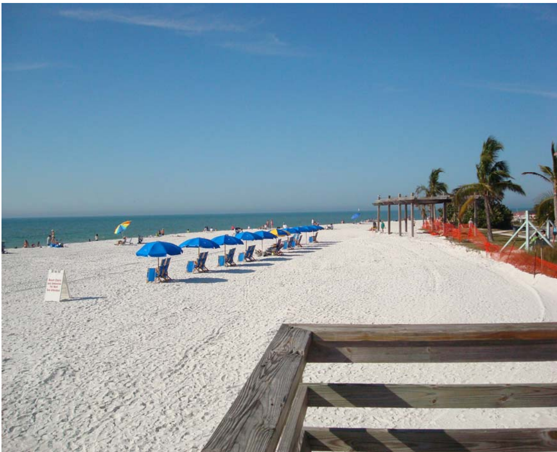
Photograph of visitors enjoying the restored beach.

Mr. Krulder reports, "The sand on the new beach is incredibly soft and very inviting. We have already had a huge influx of visitors who have waited months on end to see the improved beach and it has not disappointed! Even the shorebirds have flocked to this new sand."