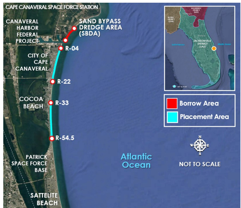
Overview of the sixth iteration of the Canaveral Harbor Sand Bypass project dredge and placement areas.

The USACE-led project is being executed in partnership with the non-Federal sponsor, Canaveral Port Authority, Brevard County Natural Resources Management Department, their costal engineering consultant Foth/Olsen, and U.S. Space Force Space Launch Delta 45 to ensure the project is delivered efficiently, safely, and on schedule.