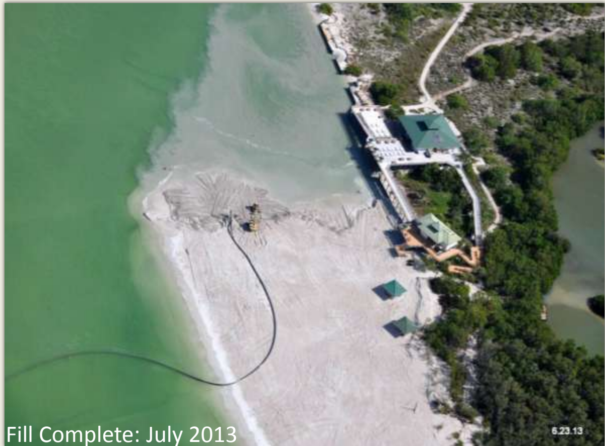
Fill Complete: July 2013