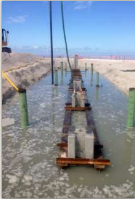
Groins Complete: Oct 2013