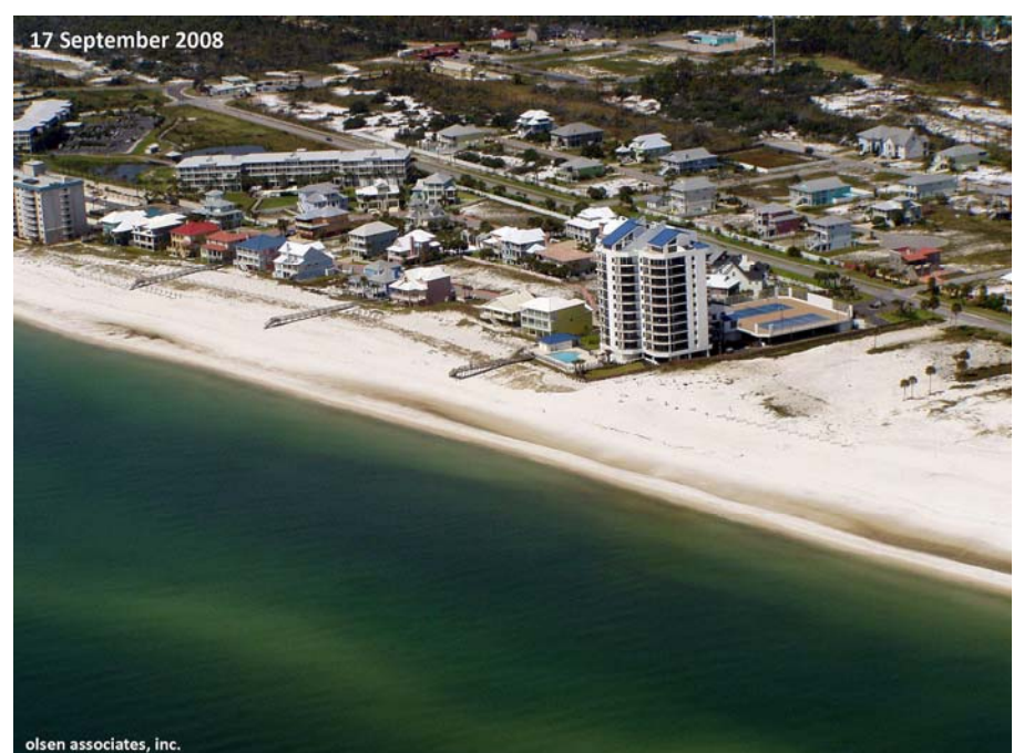
Escambia County, Perdido Key Beach Restoration Project on September 17, 2008 at R31 Lands End