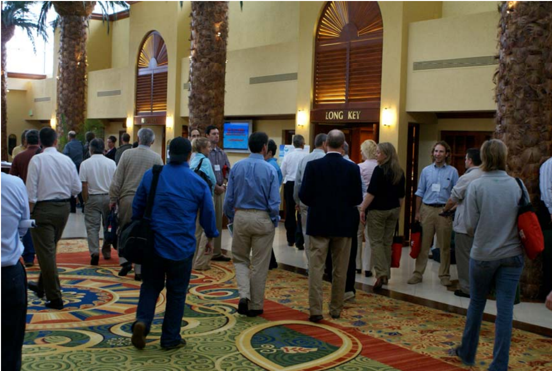
Attendees head back into session