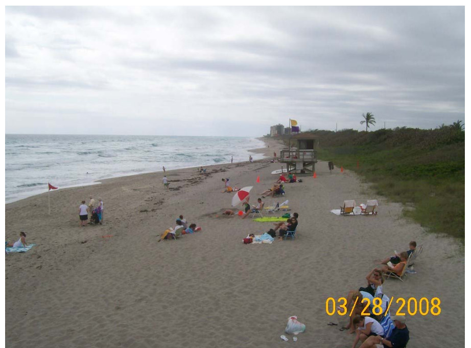
Palm Beach County, Juno Beach Nourishment Project Photo taken at R31 from the Juno Beach Pier (Rob Buda, DEP, March 2008)