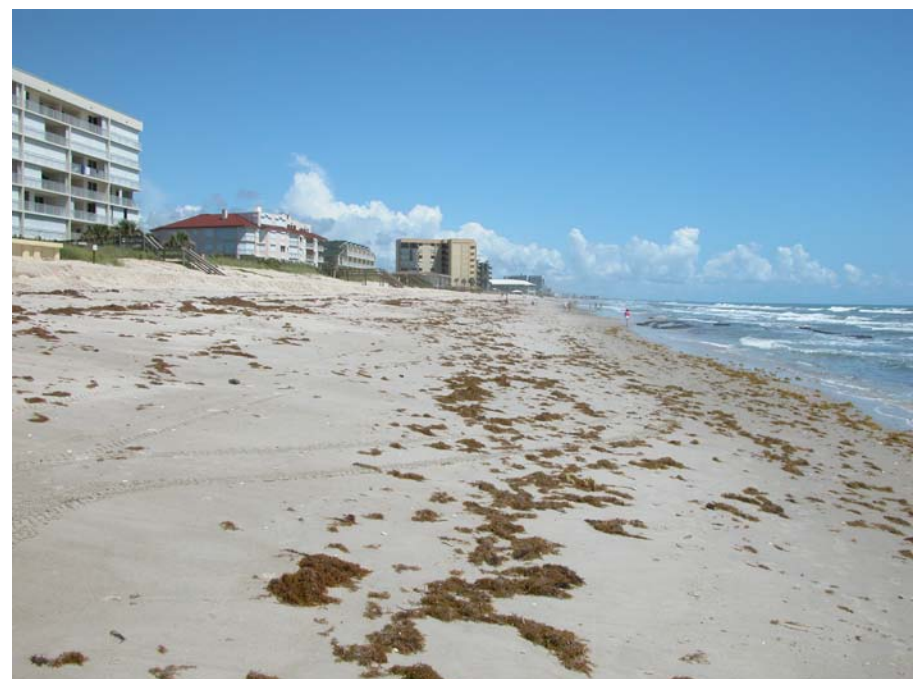
Brevard County, Mid Reach Beach Restoration Project Photo taken at R92 (June 2006)