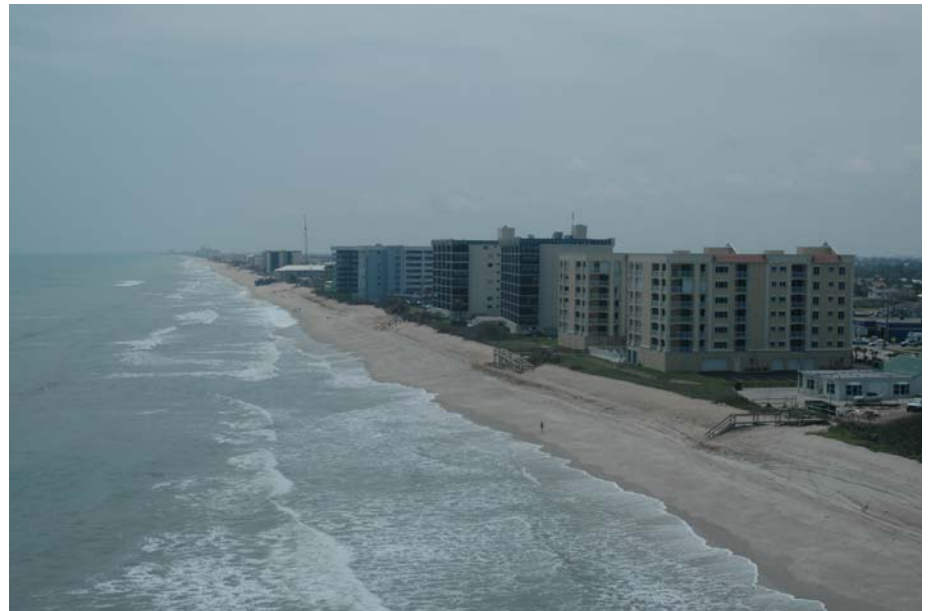
Brevard County, Mid Reach Beach Restoration Project Photo taken at R87 (May 2005)