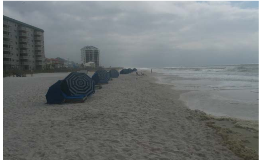
Escambia County, Perdido Key Beach Restoration Project Photo taken at R30 (DEP, May 2008)