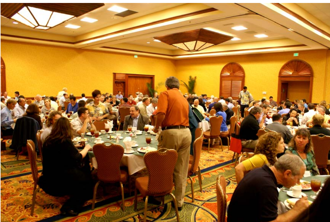
Conference Attendees enjoy the tasty buffet luncheon sponsored by the St. Petersburg/Clearwater Area Convention and Visitors Bureau