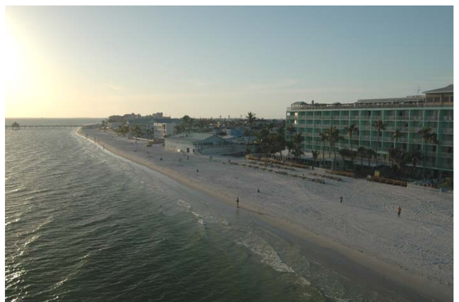
Lee County, Matanzas Pass Dredging and Disposal Area Photo taken around R185