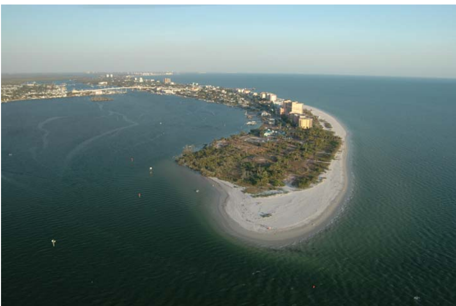
Aerial of Matanzas Pass (DEP, May 2006)