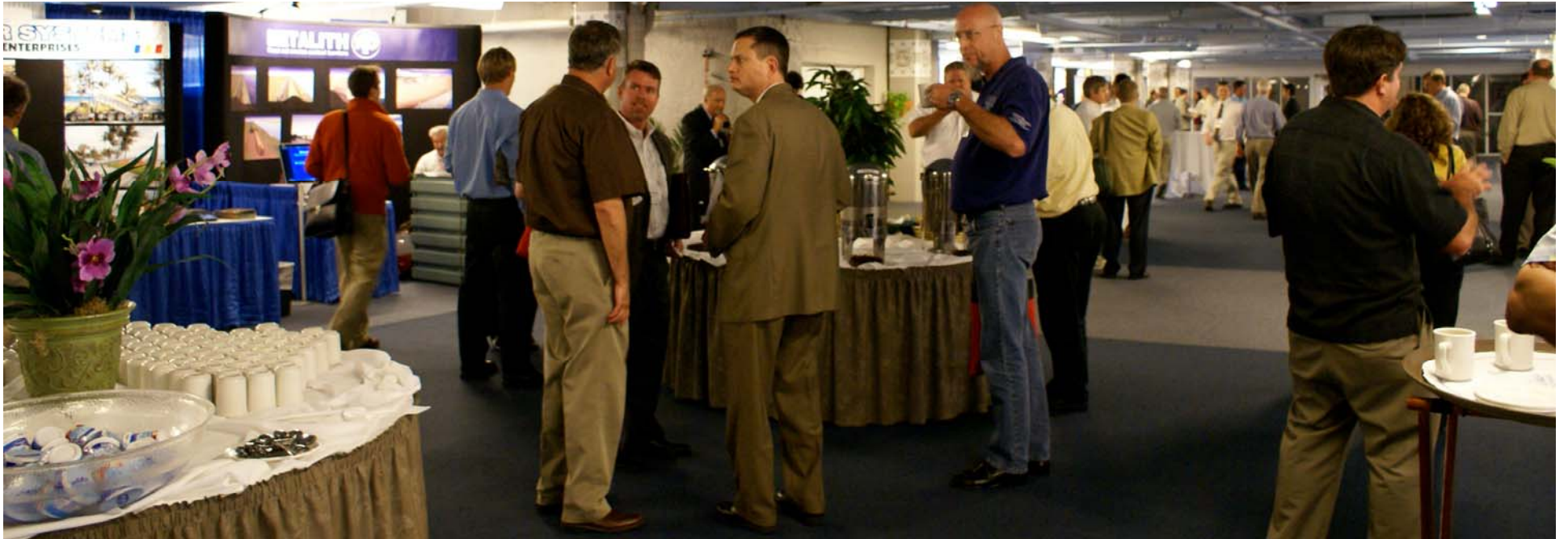
Attendees enjoy networking during a sponsored break in the exhibition hall. More than 20 companies displayed their wares during the three-day conference in St. Petersburg Beach.

Wednesday's opening session was packed with excellent presentations and speakers. The conference opened with a review of an interesting assessment of Hurricane Ike damages, and we also heard about various projects from all along the East Coast. Thursday's concurrent sessions provided an opportunity to learn about a variety of topics: environmental challenges, inlet management, wave modeling, and more projects! We all seem to especially appreciate hearing about project experiences. Friday closed with presentations on beach erosion control structures as well as discussion on Florida's offshore sand resources.