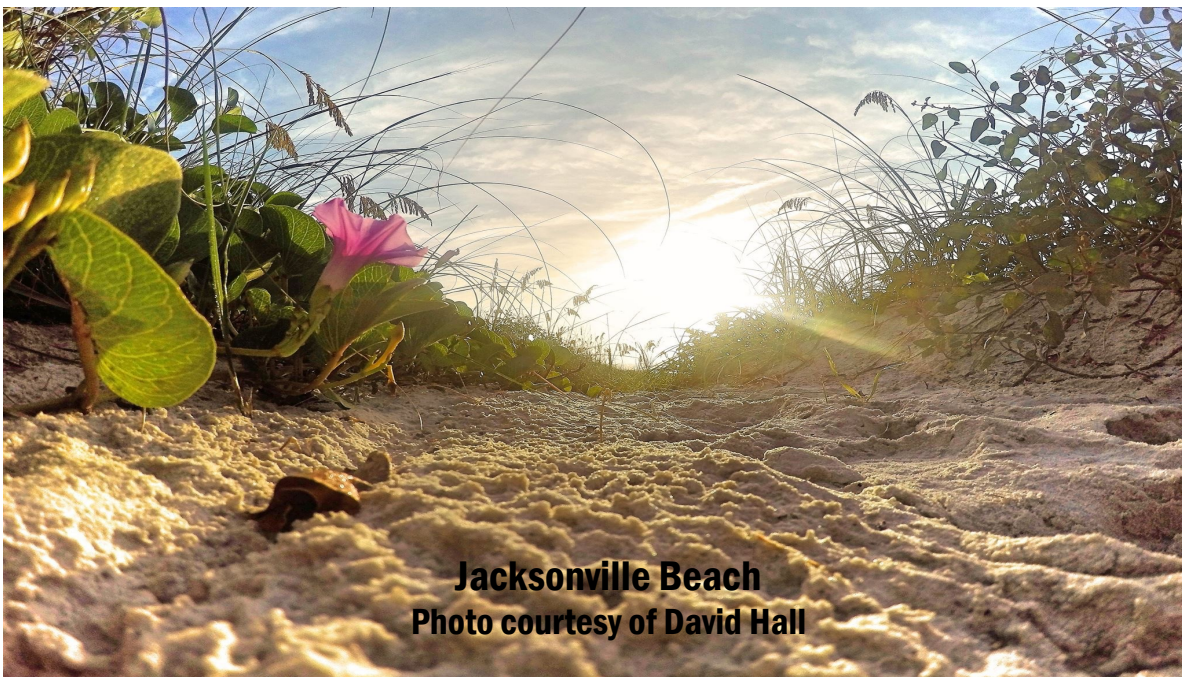
Jacksonville Beach