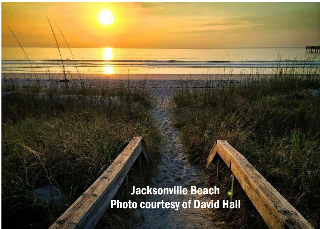
Jacksonville Beach