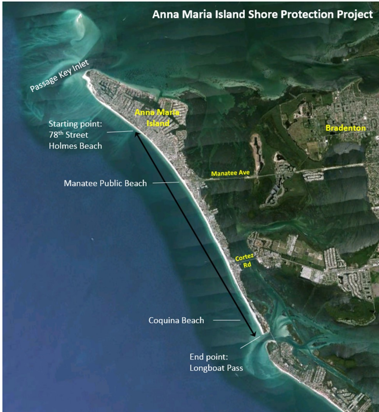
Figure 1: 2020 Beach Nourishment Extents