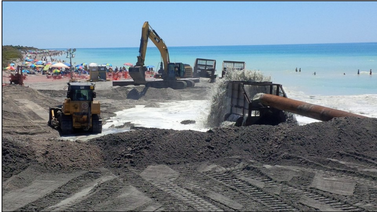
Figure 2: Photos of the ongoing construction of the Venice Beach Segment, Sarasota County Shore Protection Project.

The project was successfully completed in May 2015. The City of Venice, subsequently, organized the “Celebrate the Sand” ceremony on June 5, 2015 to commemorate completion of the beach nourishment project. Congressman Vern Buchanan was the keynote speaker of this ceremony. He commended the Corps of Engineers on the excellent work done on the project. The Corps of Engineers, in partnership with the City of Venice, achieved successful execution of beach nourishment at Venice Beach, Sarasota County, FL.