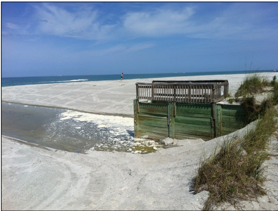
Figure 1: Flamingo Ditch outfall.

Nourishment of the Venice Beach Segment Sarasota County Shore Protection Project began in January 2015. The work is in accordance to the anticipated 10 year cycle of nourishment for the Venice Beach Segment, and is cost share 65.8% Federal and 34.2% non-Federal.