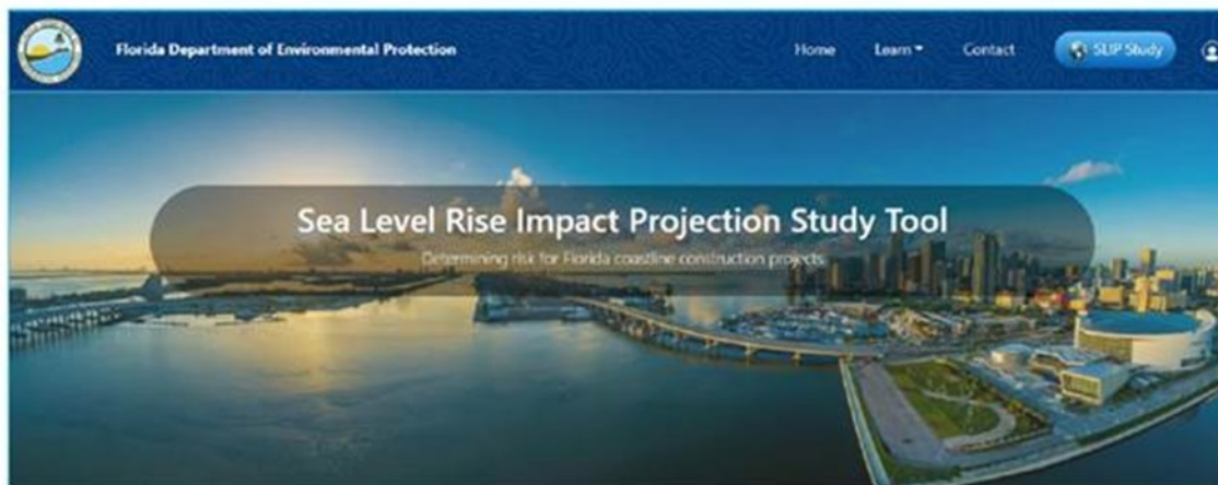
The above image is from the second rule development workshop. It shows the proposed home page of the SLIP study tool that will be on the Department of Environmental Protection’s website.