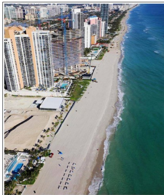
Figure 1: Aerial Photos from the Sunny Isles Beach Renourishment Project (Ramage Plaza Marco Polo Beach Resort (left) and Marenas Resort (right)).