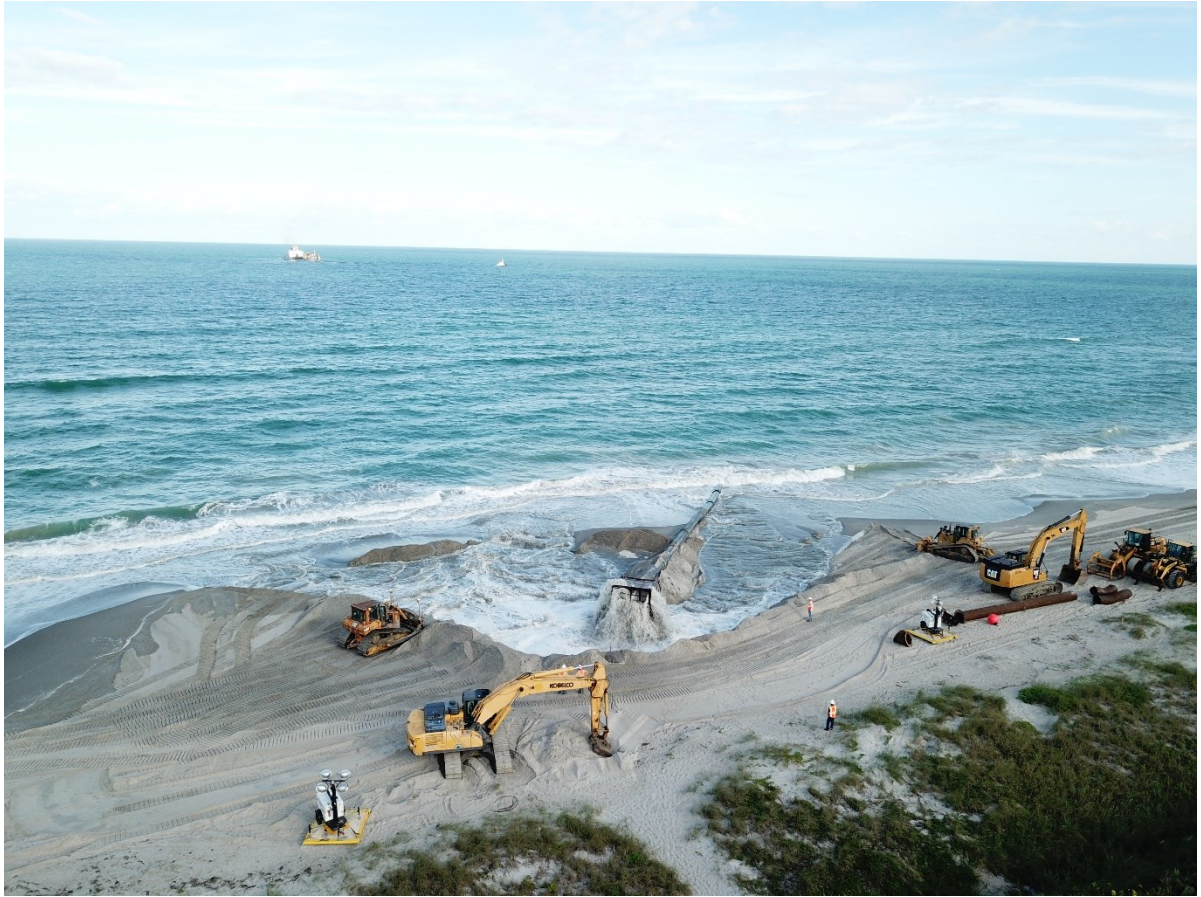
Construction of the Brevard County, FL Shore Protection Project by The Dutra Group during the 2019 - 2021 renourishment