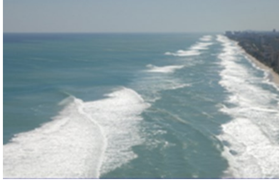
Waves breaking over Florida's Coral Reef along Broward County during Superstorm Sandy, 2012.