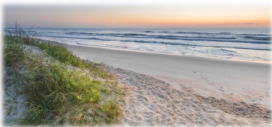
Anastasia State Park