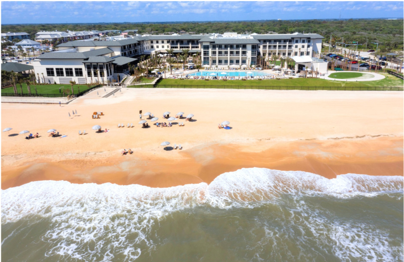
Embassy Suites by Hilton St. Augustine Beach Resort