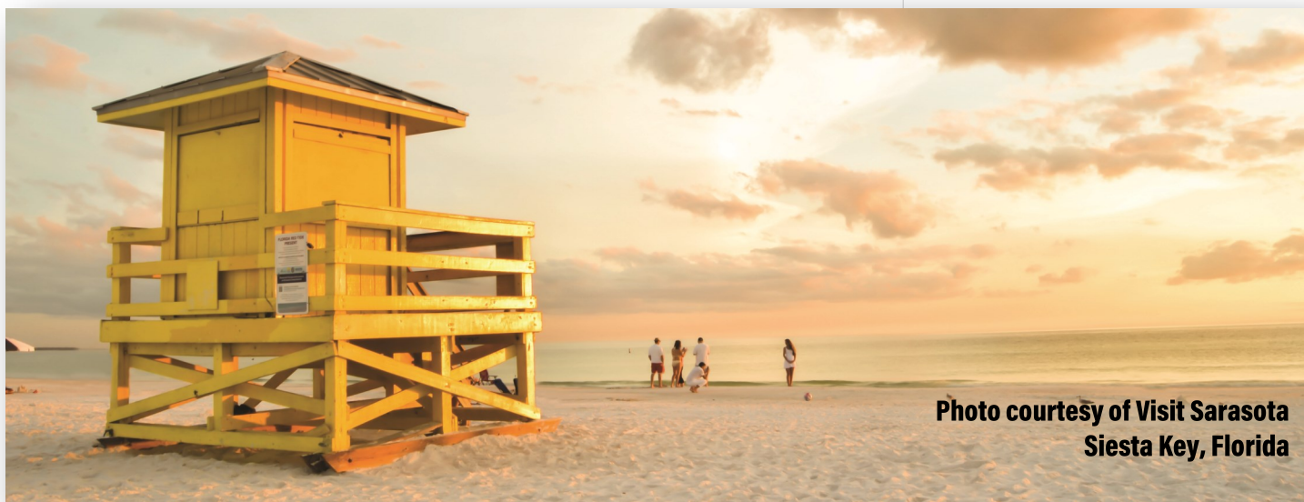
Siesta Key, Florida