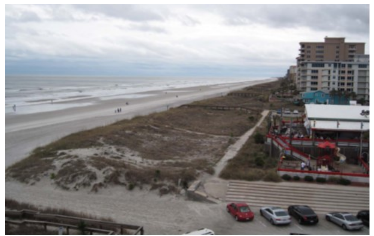
Figure 11: Jacksonville Beach in 2011