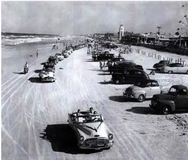
Figure 2: Jacksonville Beach during the early 1960s

Hurricane Dora formed in the Atlantic Ocean on August 28, 1964. As it crossed the Atlantic, Dora continued to strengthen until peaking as a Category 4 hurricane on September 6. Hurricane Dora made landfall near St. Augustine, Florida as a Category 3 storm on September 10 th . In Florida, nearly 10,000 homes received damage and 156,000 homes lost power. Floodwaters rushed up Atlantic Boulevard and onto A1A as the floodwalls that protected the beach were overwhelmed. Numerous houses fell into the Ocean as steady winds of greater than 65 mph pounded the coast. Figure 1 shows the water breaking through and washing away a house in Atlantic Beach, FL.