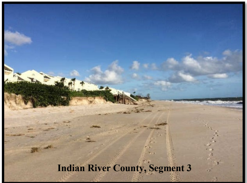
Indian River County, Segment 3

The most consequential problems and issues resulting from Matthew with precedent for the statewide beach management program will have to be expressly considered by the Legislature. How lawmakers respond to these issues, and to what extent they can also address the traditional FY2017/18 program will largely determine how Florida's beaches fare in the near future.