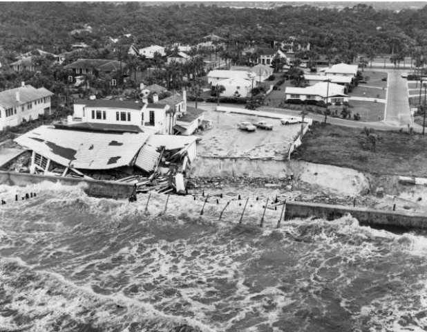
Figure 1: Damage caused by the storm surge in Atlantic Beach during Hurricane Dora

Hurricane Dora and Hurricane Matthew struck Jacksonville Beach, Florida almost 52 years apart but they will be tied together as the strongest hurricanes to directly strike the coastal city.