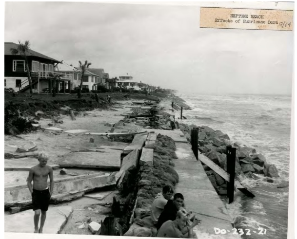
Figure 8: Damage from Hurricane Dora in 1964