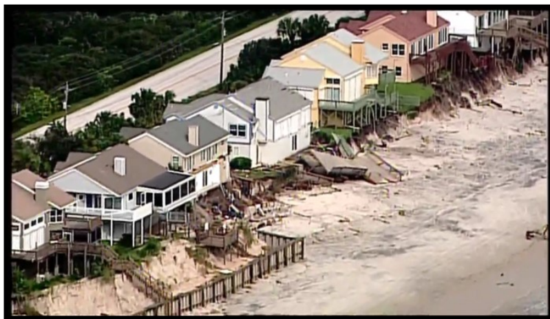
SPV - Vilano Beach area post-storm, Hurricane Matthew

The Legislature must decide how best to address these major segments of shoreline that don't typically qualify for state funding or don't satisfy the access and parking requirements. No one at this point in time is suggesting major beach nourishment projects, just area-wide dune enhancement for these three major segments of shoreline. DEP anticipates these dune projects may be coupled with FEMA Cat B emergency berm ("speed bumps") funding. It bears repeating, the projects envisioned are not major restoration projects that most confuse for native beaches, but are at best storm protective berms with short beach extensions. They are very costly, high cy/ft. projects, because of the severe erosion and profile lowering, and may have to rely on truck hauls or distant