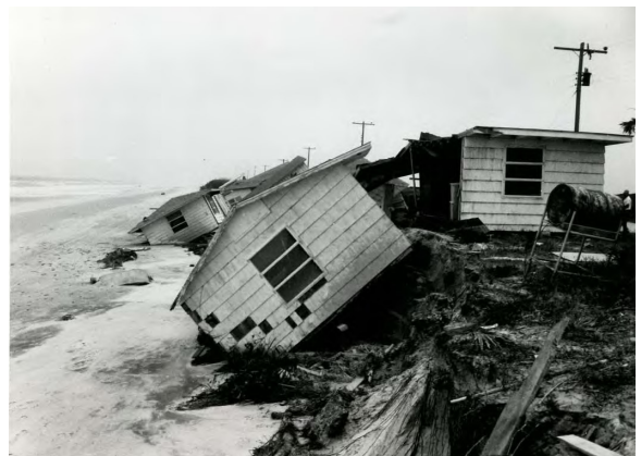
Figure 9: House falling in water during Hurricane Dora