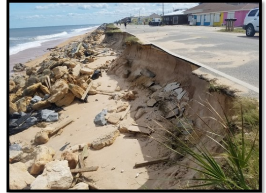
Flagler Beach post storm Matthew impacts.

The impact of Matthew has made it the responsibility of decision-makers to focus on how best to grow the number of miles of managed beach to include in some responsible fashion the most vulnerable beaches without projects. Unfortunately, even that number has increased to include major segments of beaches that weren't even designated as critically-eroded prior to Matthew, and in turn not eligible for state funding. I haven't heard anyone suggest this outcome would be what we are witnessing as a result of the hurricane. Miles of unprotected beaches and upland development, no local beach program, no history or involvement in the statewide program, and no existing projects. This includes almost two entire counties – Flagler and Volusia (except Ponce Inlet IMP). While not certain of timing or impact, at least Flagler had the only federal shore protection project authorized in WRDA 2016. (It's just a 2.6 mile protective dune structure to protect what is now a failed segment of A1A.) The rest of the county (15 miles), a large portion of Volusia's 49-mile shoreline, and approximately 7 miles of St. Johns County's shoreline from South Ponte Vedra to Vilano Beach have been severely-impacted, with homes perched on sand cliffs, infrastructure damage, and significant upland flooding. No simple answers, very difficult deliberations, and a historically effective state program that does not readily accommodate them.