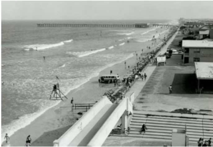
Figure 10: Jacksonville Beach in 1973

The pictures below (Figures 10-11) show how the beach has changed from before the Shore Protection Project to 2011, at the time of the fifth renourishment.