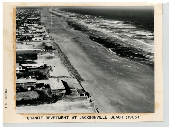
Figure 5: Rock revetment at Jacksonville Beach in 1963