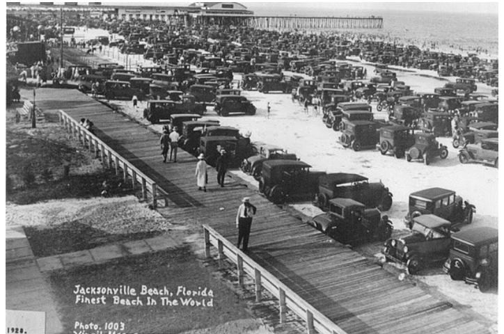
Figure 3: Jacksonville Beach in 1928