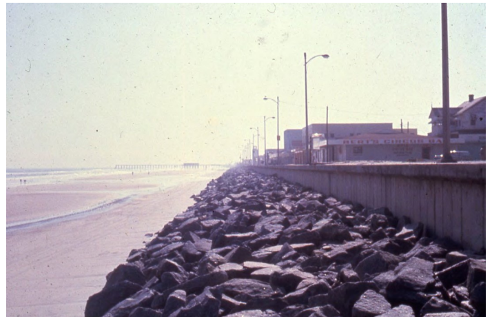
Figure 4: Rock revetment at Jacksonville Beach in 1965