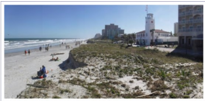
Figure 7: Dune erosion at Jacksonville Beach in October 2016