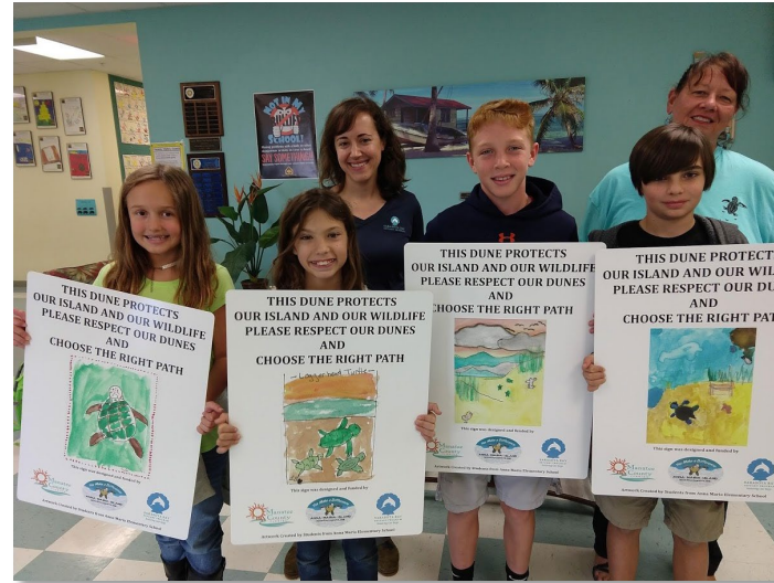
Dune Signs with Kid Art